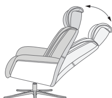
EFFORTLESS RECLINING MECHANISM