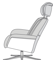
HEIGHT ADJUSTABLE HEADREST SYSTEM