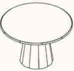
Round Dining Table 1200 Dimensions 1200 x 1200 x 760